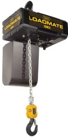
Fixed Top Hook